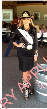
^ NOT LEATHER ^