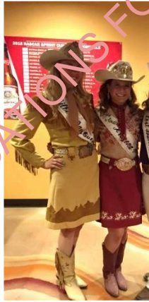
^ NOT LEATHER ^

Several stores here in Mohave County sell dresses, skirts, jackets, etc. that would be appropriate for the fashion forward outfit. They DO NOT have to be purchased from a prior queen or queen dress designer. Here is a list of a few stores to try: