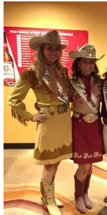
^ NOT LEATHER ^