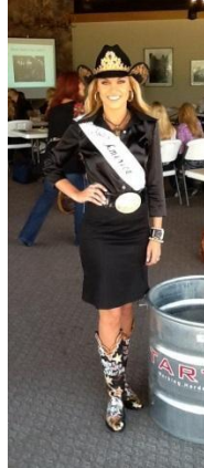
^ NOT LEATHER ^