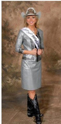
^ LEATHER ^

****You can wear leather if you choose BUT it is NOT required!!!!!!