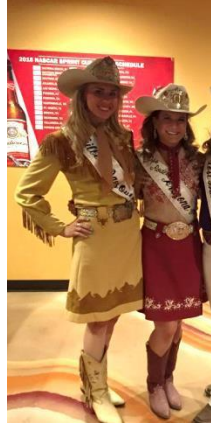
^ NOT LEATHER ^