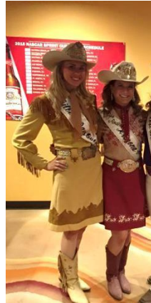
^ NOT LEATHER ^