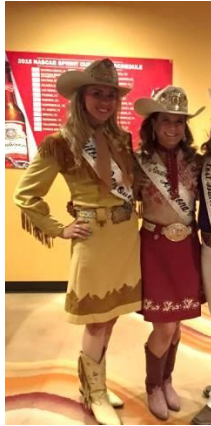
^ NOT LEATHER ^

Several stores here in Mohave County sell dresses, skirts, jackets, etc. that would be appropriate for the fashion forward outfit. They DO NOT have to be purchased from a prior queen or queen dress designer. Here is a list of a few stores to try: